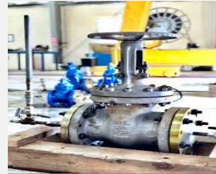
Valve Repair & Testing